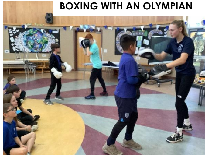
BOXING WITH AN OLYMPIAN